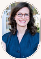
Founder & Director