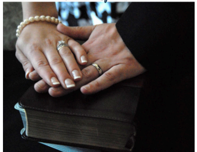
A Devotional Journey for Husbands Walking with Wives through Sexual Trauma

At GRACE Ministries of Alabama, we recognize that true healing happens within the context of community and God-centered love. This new devotional offers husbands biblical encouragement and practical wisdom to stand beside their wives with grace, empathy, and spiritual strength.