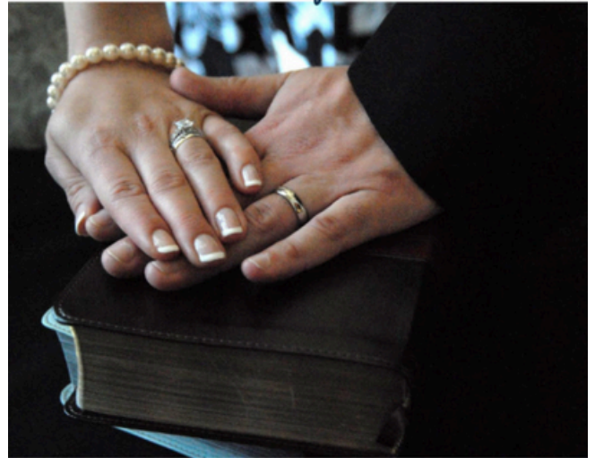
A Devotional Journey for Husbands Walking with Wives through Sexual Trauma

It has been so amazing to see how God is working through our YouVersion Bible Plans! So far, we have over 237,124 subscribers, have had 35, 551 completions, and have reached 216 countries around the world – what a blessing to know that more women and now husbands around the world are encountering the redemptive work of Christ as they journey through healing! We couldn't be more encouraged by the bravery of these women and men, and the way God is meeting them right where they are.