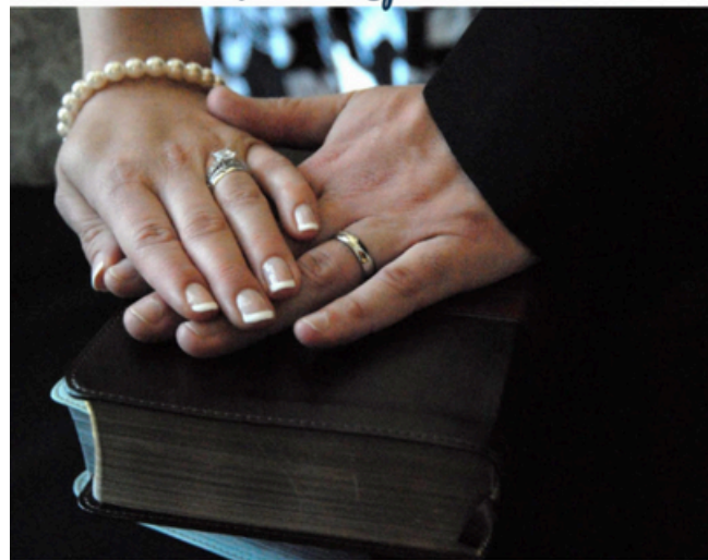
A Devotional Journey for Husbands Walking with Wives through Sexual Trauma