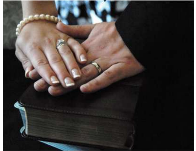
A Devotional Journey for Husbands Walking with Wives through Sexual Trauma

We are continually in awe of the ways God is moving through our YouVersion Bible Plans. What started as a step of obedience has now grown into a global reach—over 279,000 subscribers +, 35,000+ completions, and readers in 216 countries around the world. It's incredibly humbling to know that women—and now husbands—across the globe are encountering the redemptive work of Christ as they walk through healing.