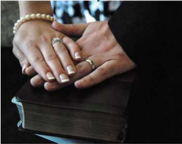
A Devotional Journey for Husbands Walking with Wives through Sexual Trauma

Our devotional series, GRACE Abounds for the Spouse, has now reached 3,275 subscribers, with 962 completions across 69 countries worldwide. God has exceeded our expectations, using this resource to support spouses walking alongside their partners on the journey of healing from sexual abuse.